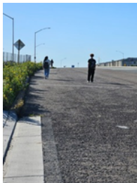
Students walking home from school in the street on Otay Mesa Rd between Caliente Ave & Sea Fire Point