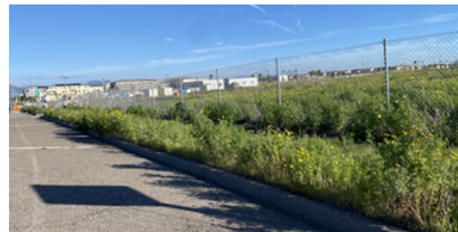
No accessible sidewalk for pedestrians walking on Otay Mesa Rd from Caliente Ave