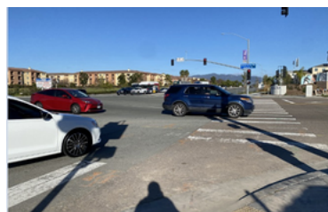
Crosswalks on intersection between Caliente Ave & Otay Mesa Rd need to be repainted