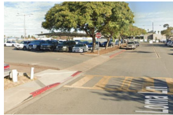
The exit of school parking lot needs a clear "Do Not Enter" sign and the crosswalk on Loma Ln needs a pedestrian crossing road sign