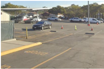
The walkway that leads into the school parking lot needs to be extended for families to safely cross traffic