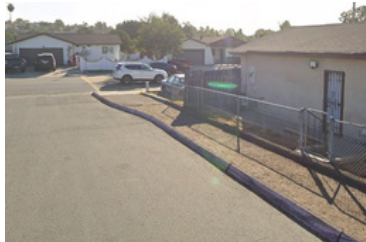
Dirt path that leads to Loma Verda Elementary from Loma Ln needs pavement and maintenance