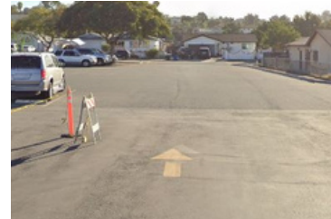
Traffic direction arrows are missing on one half of the school parking lot