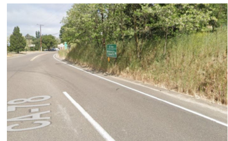
Some students walk along the narrow edge of CA-78 to get to and from school