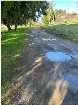
Mud and puddles on the dirt path on the way to school on Cape Horn Ave