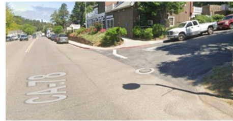
The intersection of CA-78 & C St does not contain a 4-way stop or labeled crosswalks