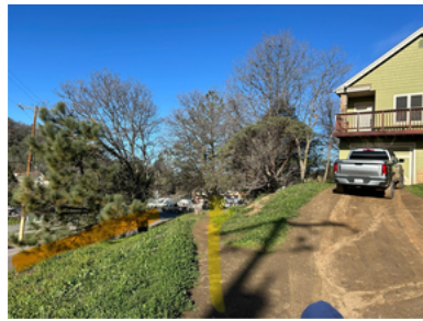
Another view of the dirt path that leads into town toward C St