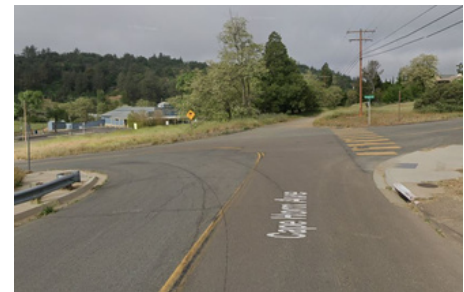
3 routes to take to and from school, the most popular being Cape Horn Ave which becomes a dirt path after its intersection with 2nd St