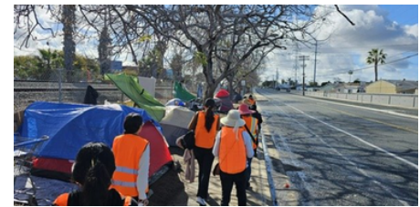
Numerous homeless encampments along Industrial Blvd between Naples St & Palomar St