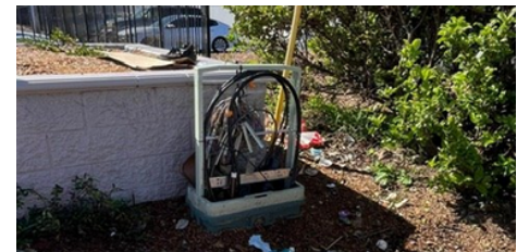
Exposed electric boxes on Oxford St between Broadway & Industrial Blvd