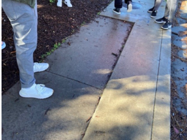
Lifted sidewalks along Naples St between Broadway & Industrial Blvd