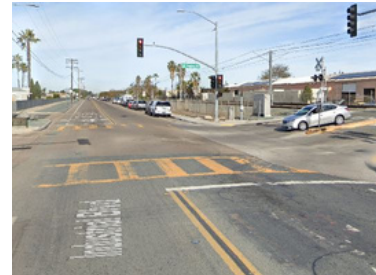
Faded crosswalks on the corner of Industrial Blvd & Naples St