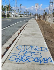
Speed limit of 40 mph on Industrial Blvd next to Harborside Elementary