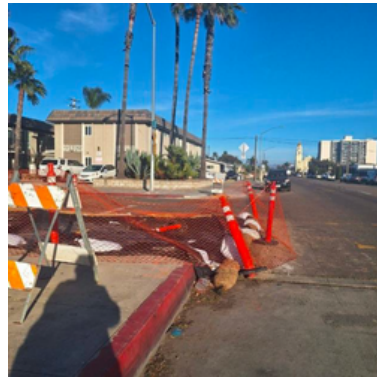
Construction blocking sidewalk at the corner of Orange Ave & Central Ave