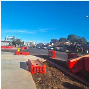
Construction barriers knocked down at the corner of Orange Ave & 39th St