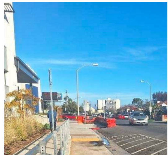
Handicap ramp needs repair in front of Central Elementary on Orange Ave between 37th St & 39th St