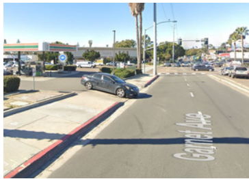
Cars merging onto Garnet Ave heading eastbound sometimes disregard pedestrians