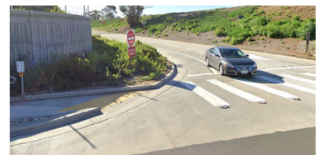
Cars exiting I-5 E Balboa Ave exit do not respect crosswalks