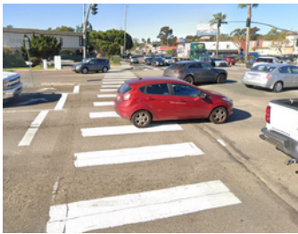
Intersection between Garnet Ave & Mission Bay Dr experiences heavy congestion