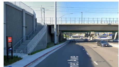
Balboa Ave Transit Center splits the busy streets of Balboa Ave and Garnet Ave