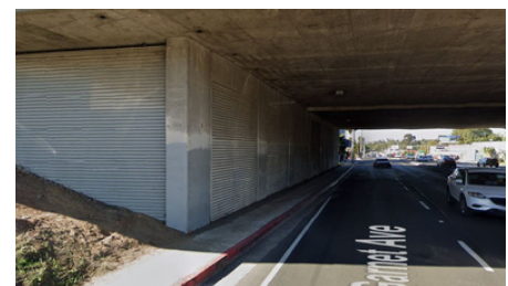
I-5 underpass on Garnet Ave contains narrow sidewalks, debris, and poor lighting