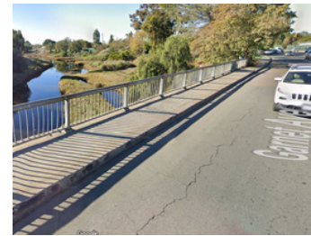
Narrow sidewalk on Rose Creek bridge