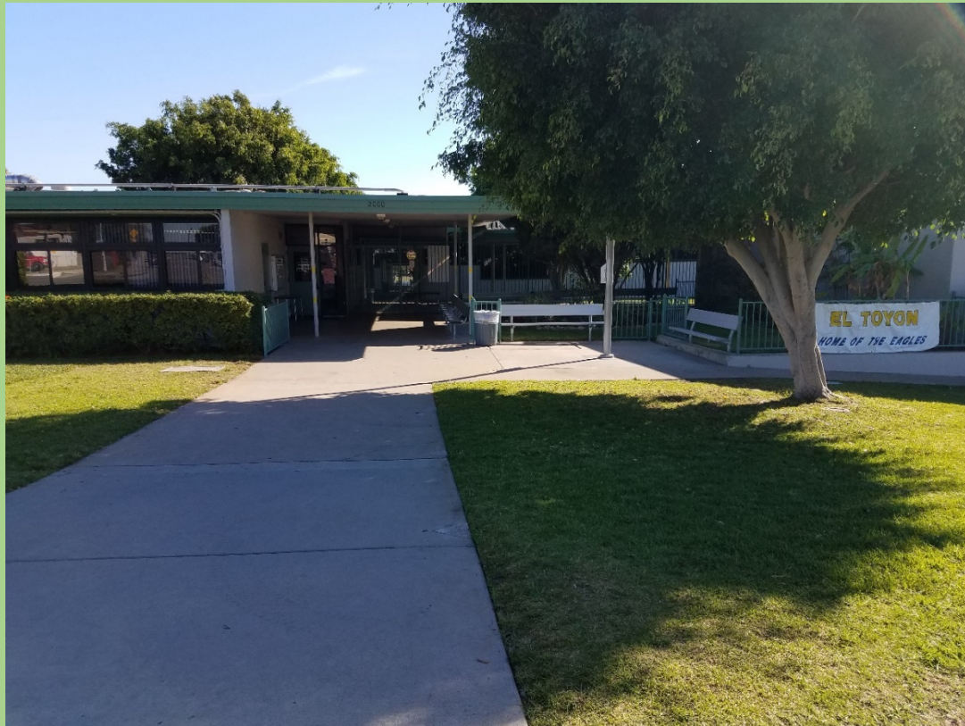
El Toyon Elementary School