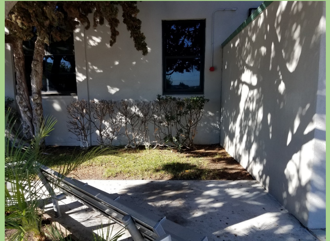
John A. Otis Elementary School