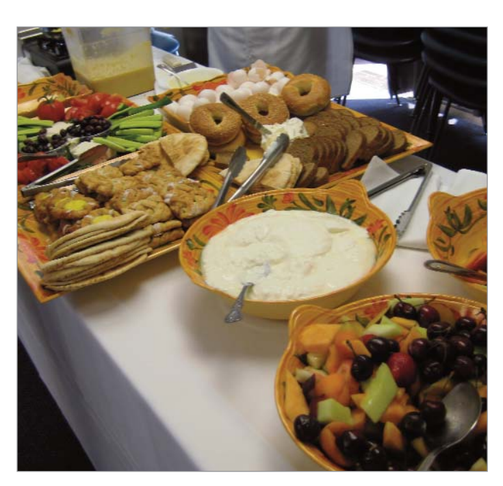
Cities that include fruit and vegetable options at meetings and events help employees stay healthy.

The City of San Leandro's Recreation and Human Services Department established a wellness policy that sets nutritional guidelines for meals and snacks at its youth and senior programs. Recommended snacks include fresh fruits and vegetables;