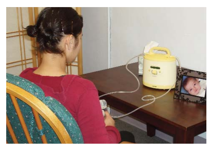
Providing lactation rooms helps mothers maintain breastfeeding when they return to work.