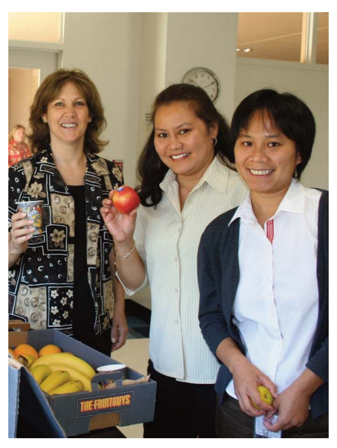
Healthy food choices on the job help workers stay more alert and focused.

nuts and dried fruits; multi-grain breads, tortillas and crackers; and low-fat and no-sugar spreads. Brentwood's City Council adopted a wellness policy whose nutritional guidelines ensure that staff and residents have healthy choices among items sold at public facilities.