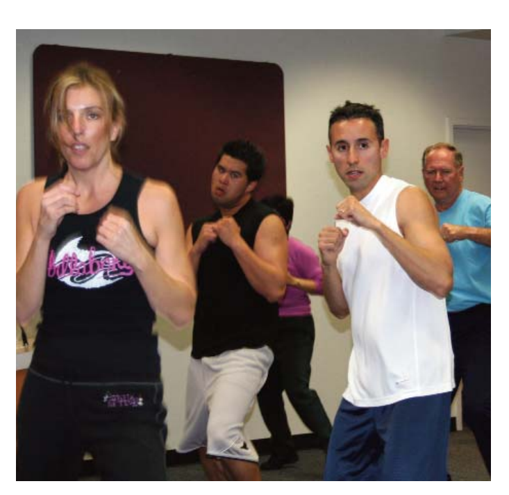
Cities can partner with local organizations to run exercise classes.

• 10-Minute Physical Activity Opportunities Employees can reap meaningful health benefits from even a single 10-minute physical activity break each day. Benefits include improvements in blood pressure, waist circumference, mood states, cumulative trauma disorders, attention span and other clinical measures. Cities can establish a policy to adopt UCLA's Lift Off! program to introduce short exercise breaks throughout the work week at a set time each day and at meetings lasting more than one hour. Orange County's Public Health Department adopted the Lift Off! program, giving employees 10 minutes of paid time to participate if they choose. Employees who choose not participate do not receive the extra paid break.